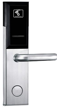
L517W-B / 527W-B with black cover