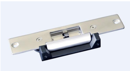
EL-138LNC/NO-S (Long Type American Strike)